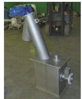
Solution in tank